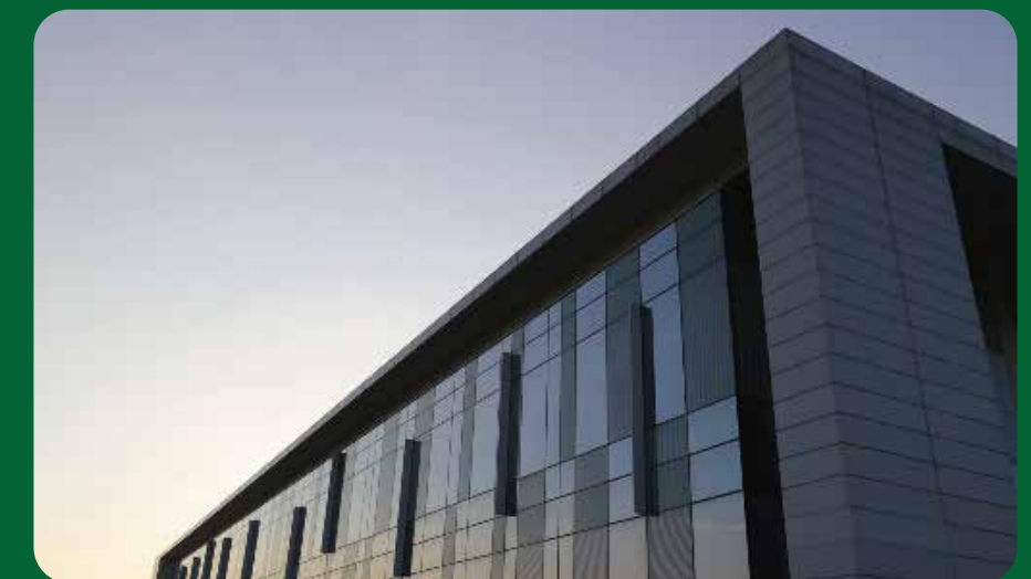
* Duke Kunshan University

Based in China, a country with a diverse population facing variety of health challenges across its social, cultural, economic and geographic divides, the program is well-situated to offer a unique setting in which to study global health. The campus is located in Kunshan, which falls geographically within the "One-hour Economic Circle" in the Yangtze River Delta. Kunshan has won many distinctions, including ranking at the top of Forbes China's Best County-level cities in Mainland China for four consecutive years and